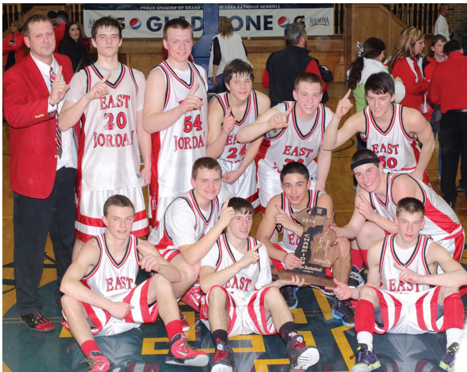
The 2014 Class C regional champion East Jordan Red Devils.

The Red Devils were up a majority of the contest and were able to push leads at different