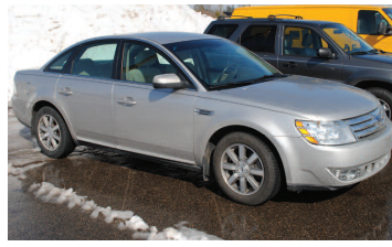
2008 FORD TAURUS V-6, very nice. AS LOW AS $199 A MONTH