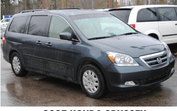
2005 HONDA ODYSSEY Touring pkg, leather, heated seats, loaded. AS LOW AS $179 A MONTH