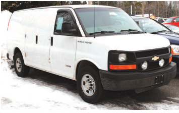
2005 CHEVY EXPRESS CARGO VAN Only 91 K, storage bins. AS LOW AS $199 A MONTH