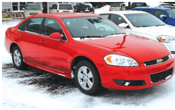
2010 CHEVY IMPALA LT Loaded, 29 MPG, very nice. AS LOW AS $189 A MONTH