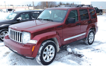
2008 JEEP LIBERTY LIMITED 4x4, leather, sunroof, tow pkg, nice AS LOW AS $199 A MONTH