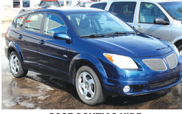
2005 PONTIAC VIBE Air, cruise, lots of cargo room. Only 59 K. AS LOW AS $179 A MONTH