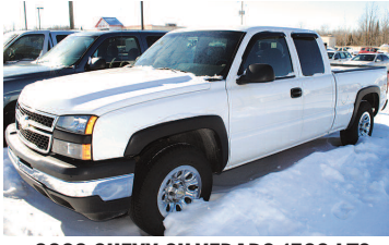
2006 CHEVY SILVERADO 1500 LT3 Ext cab, 4x4, bedliner tow pkg. AS LOW AS $199 A MONTH