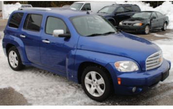
2006 CHEVY HHR LT 30 MPG, air, cruise, lots of cargo room and seats 5. AS LOW AS $179 A MONTH.