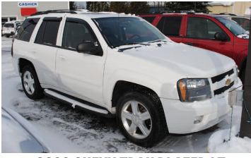
2008 CHEVY TRAILBLAZER LT 4WD, sunroof, tow pkg, leather, loaded. Only 75 K. AS LOW AS $199 A MONTH