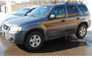
2005 FORD ESCAPE AWD, leather, moonroof, loaded. AS LOW AS $169 A MONTH