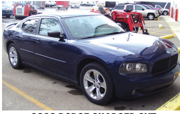
2006 DODGE CHARGER SXT This is a NICE Ride. AS LOW AS $199 A MONTH