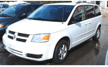
2009 DODGE GRAND CARAVAN Slow-N-Go, 3rd row seat. AS LOW AS $199 A MONTH