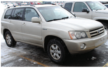
2002 TOYOTA HIGHLANDER. 4x4, 109 K, 3.0L V-6, 4 door, leather. SALE $10,995. AS LOW AS $249 A MONTH.