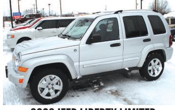
2006 JEEP LIBERTY LIMITED 4x4, power sunroof, 3.7L. AS LOW AS $199 A MONTH