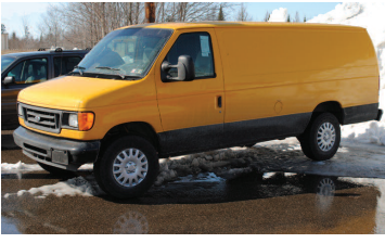
2007 FORD ECONOLINE CARGO VAN E-150, extended. AS LOW AS $199 A MONTH