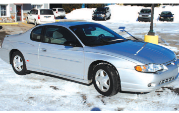
2004 CHEVY MONTE CARLO SS 2 door coupe, V-6. AS LOW AS $149 A MONTH