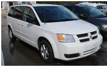
2008 DODGE GRAND CARAVAN C/V Cargo van. Air, cruise, 103 K. AS LOW AS $199 A MONTH