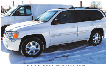
2003 GMC ENVOY SLT 4WD, leather, power moonroof, tow pkg. AS LOW AS $199 A MONTH