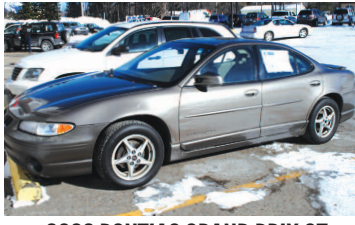
2006 PONTIAC GRAND PRIX GT V-6, traction control, 29 MPG. AS LOW AS $199 A MONTH