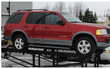
2002 FORD EXPLORER XLT 4WD, nice. AS LOW AS $159 A MONTH